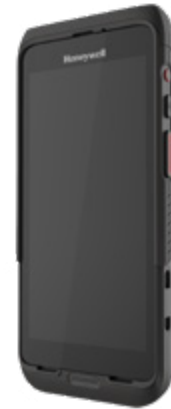
The CT47: Ultra-rugged 5G mobile computer on the Mobility Edge™ platform

CT47 mobile computers are ultra-rugged, all-purpose hand-held devices, providing reliable performance, 5G data connectivity and communications for frontline mobile workers in warehouse, logistics and fieldwork.